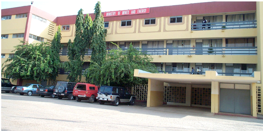
The three story Ministry of Mines & Energy Building in Accra