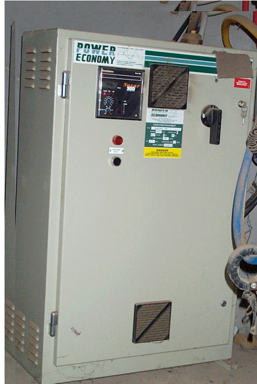
Capacitor Bank, installed at MOME

A 100kVAR automatic capacitor bank was installed to improve power factor which was 0.8 at the time to 0.96. Although the maximum demand of the building at the time was only 90kVA, this action reduced it further to 80kVA, allowing more air conditioners to be installed in 1998 without a significant increase in maximum demand. The total cost of purchase, installation and two year warranty was ₦5.5 million cedis.