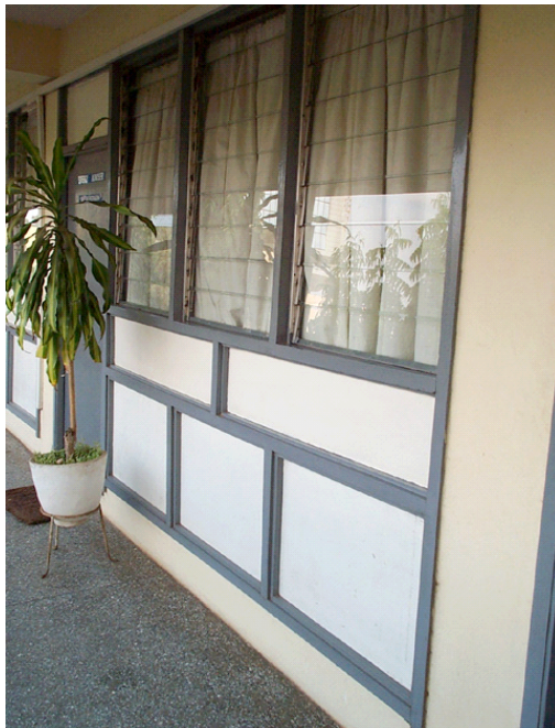
The lower louvered windows were replaced with solid flush wooden panels

overhangs that reduce the impact of solar gain and therefore improves energy efficiency, single glazed louvered windows occupied about 55% of the total surface. This permitted high rates of air infiltration and ex-filtration, thereby contributing to high heat gains through ventilation. To reduce the high incidents of ventilation heat gains, all the lower level louvered windows were replaced with solid flush wooden panels, whilst the old louver frames which did not allow for firm closure of windows were either repaired or replaced. The air conditioners were moved from the ground level to heights of 1.5-2meters above the floor level.