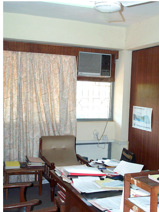
Air Conditioners were moved from the floor level to a height of 1.5-2meters.

This was done particularly to allow for even and easy circulation of cool air in the offices since cool air tends to fall as warm air rises. It was also done to prevent furniture and other objects from blocking the areas in front of air conditioner units, which could prevent or hamper air circulation. After this exercise it became possible to use one air conditioner instead of two in some of the large offices where two air conditioner units were installed since hot air infiltration was reduced to the minimum.