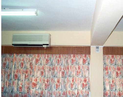
Passive Infra-Red Sensors to control lights and AC

and air conditioners when the room is not occupied for a predetermined period. They automatically switch them on when the room is re-occupied.